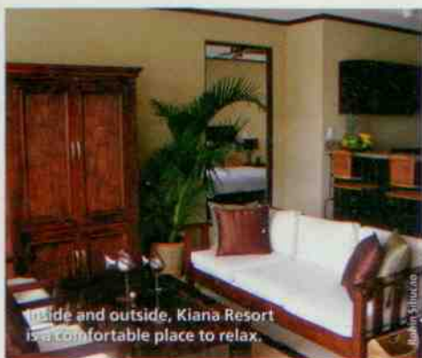
Inside and outside, Kiana Resort is a comfortable place to relax.

be booked through Kiana, as well as zip lining.