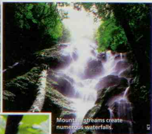
Mountain streams create numerous waterfalls.

diverse private reserve of nearly 1,000 acres near Playa Dominical, set aside to protect the varied species of birds, mammals, trees and insects. Our final destination was the Nauyaca Waterfalls, a torrent of cascading water from the River Baru, which winds its way down the mountains and through the heart of the forest before emptying into the sea.