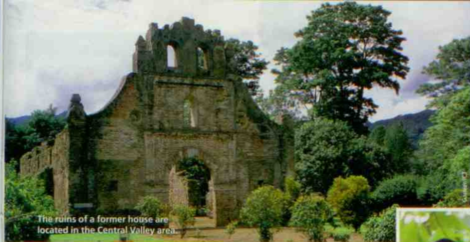
The ruins of a former house are located in the Central Valley area.