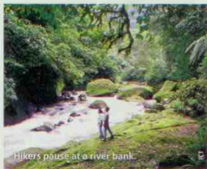
Hikers pause at a river bank.

If all of these adventures are a bit taxing, you can enjoy the customary resort offerings, such as spending time at the pool or Jacuzzi, walking the beach or enjoying